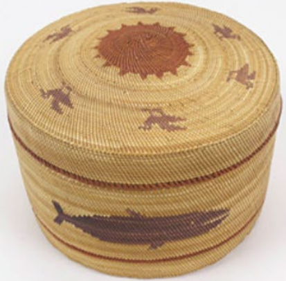
Image credit: Covered basket with bird and whale design, Makah, (Institution).

Native Knowledge 360° (NK360°) provides educators and... perspectives on Native American history and cultures. NK... educational materials and teacher training that incorpora... more comprehensive histories, and accurate information... inform teaching and learning about Native America. NK3... common assumptions about Native peoples—their cultur... United States and world history, and their contributions to... and literature.